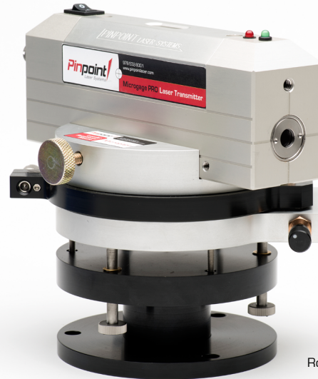
Rotational Mount Only*